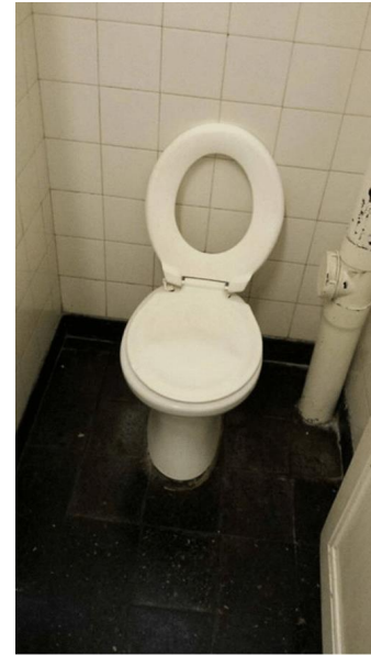
You only had one job